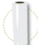
Pallet wrap & stretch film