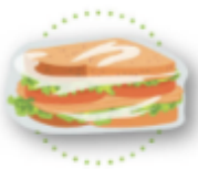
Ziploc & other reclosable food storage bags