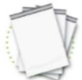
Plastic shipping envelopes