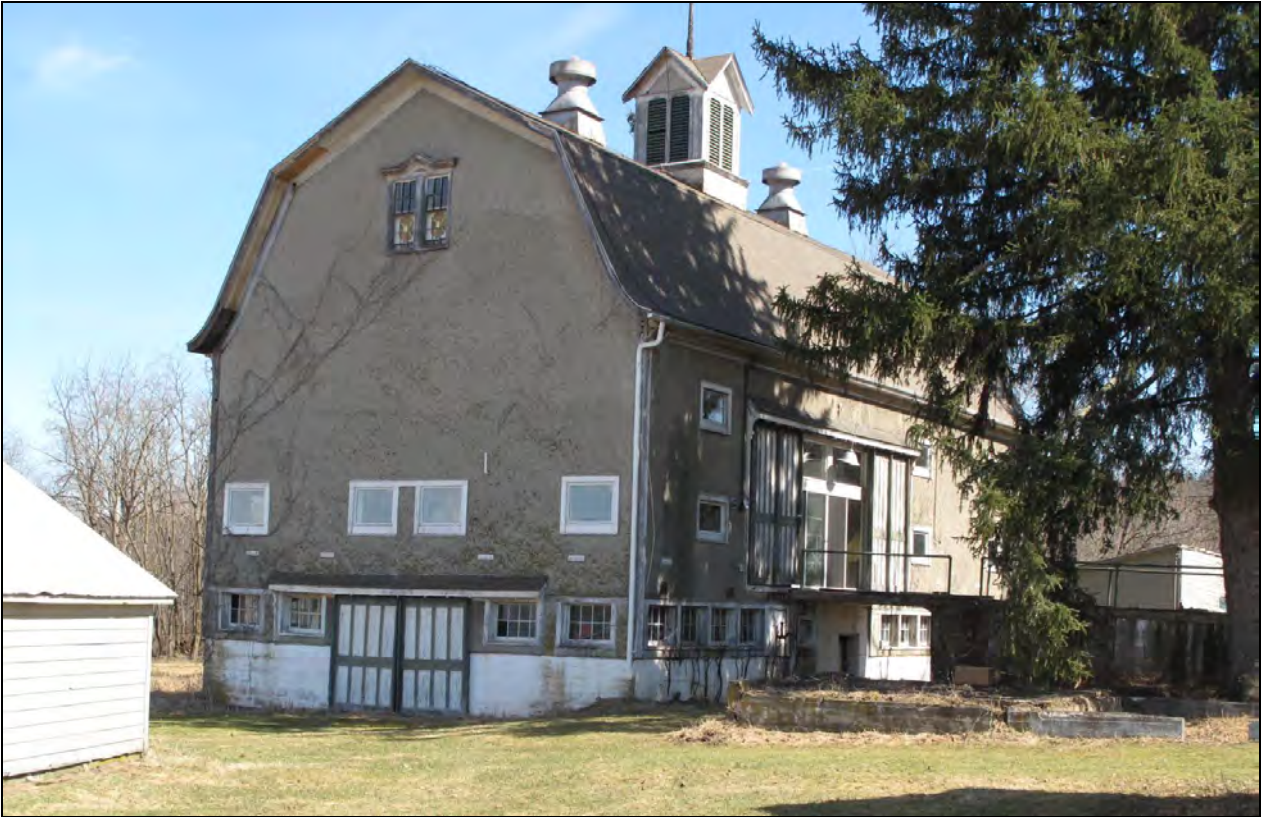
View of barn from NW.