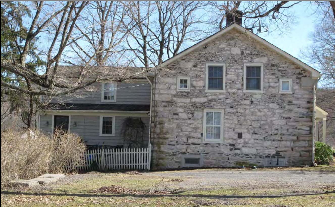
View of house from north.