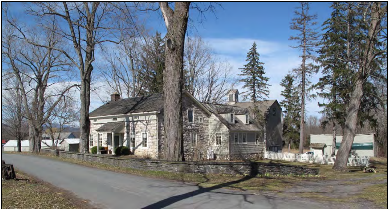
View of Alliger-Davenport Farm from southwest.