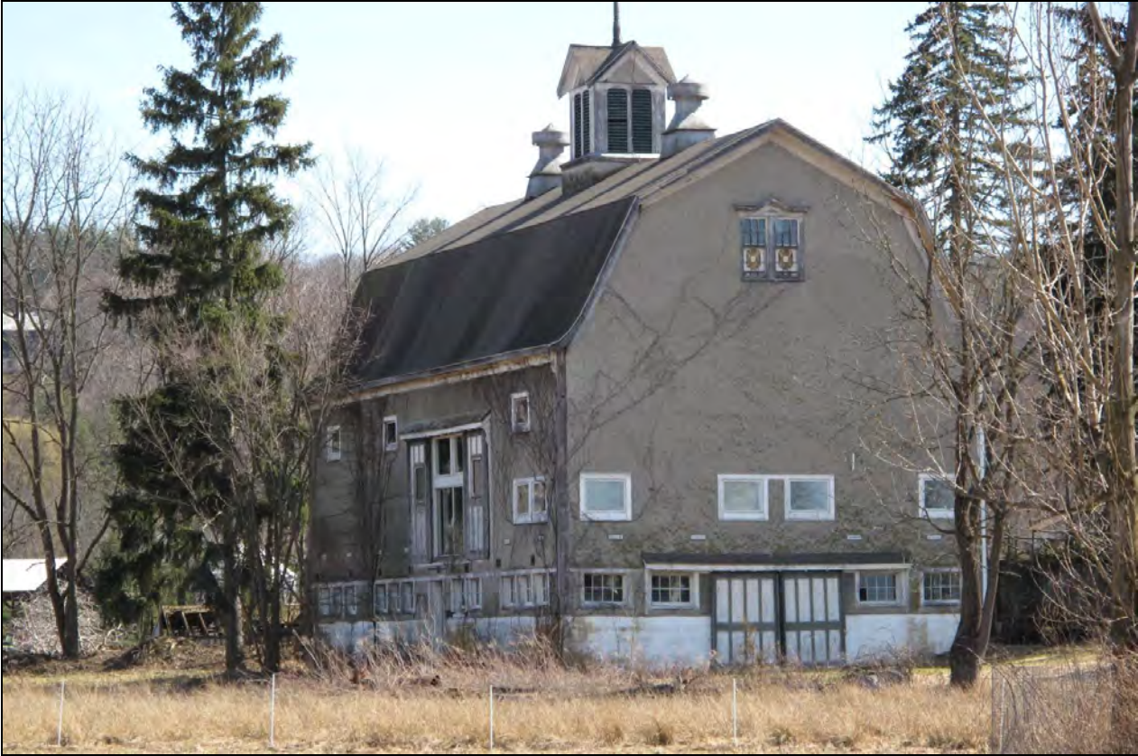
View of barn from NE.