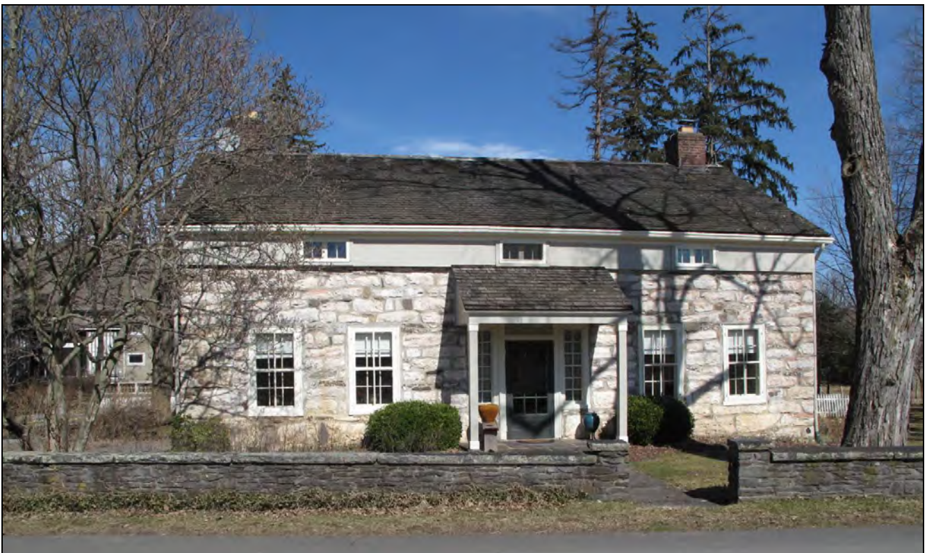
View of front façade of house from west.