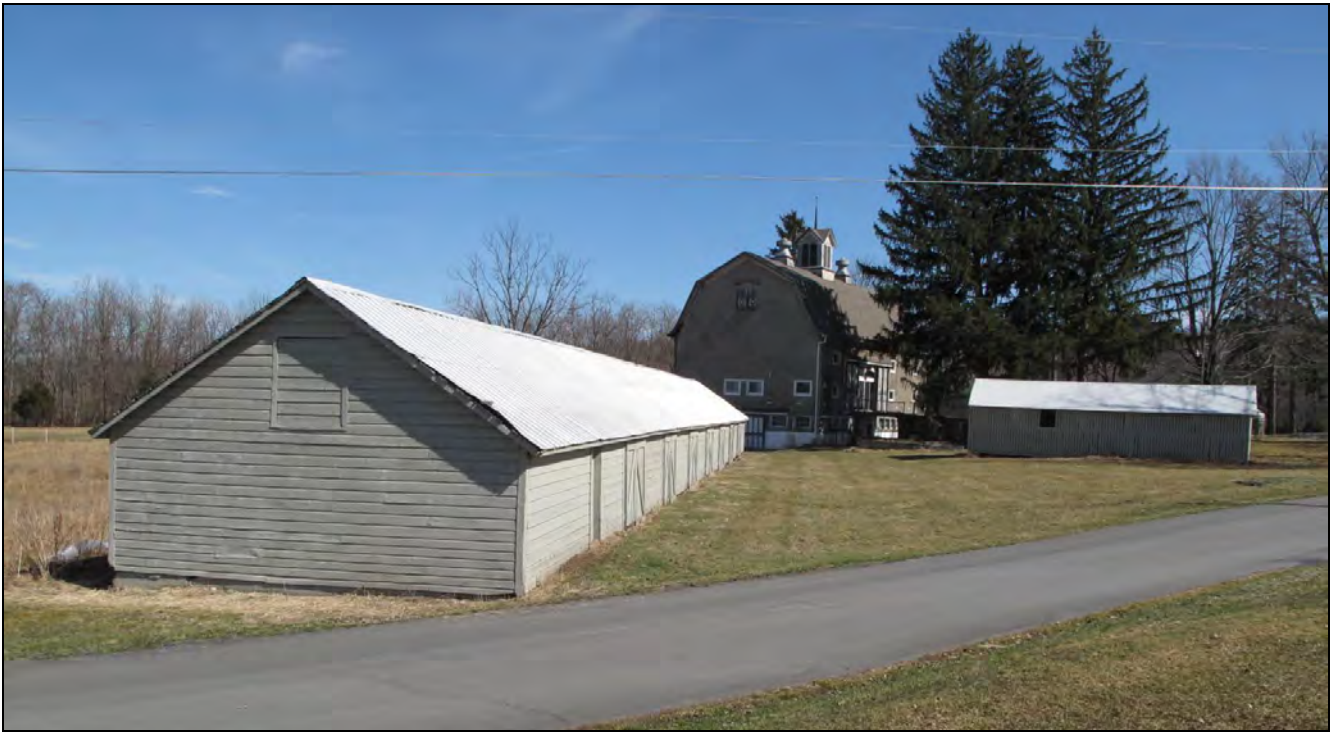
View of poultry house (left), barn (center) and corn crib (right) from NW.