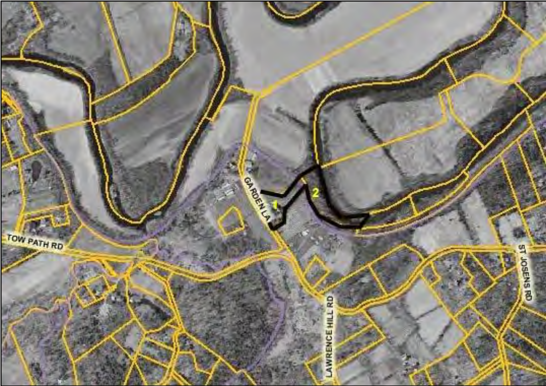
The boundary of the existing farmstead is outlined in a heavy black line. It encompasses two parcels, one containing the farmstead (1) and another containing a section of the D&H Canal (2). The original farm included farm land on the east side of Garden Lane; these were subdivided and sold to neighbors in recent years. In the 19 th century, the farm contained over than 100 acres; today the property represents less than 10 acres.