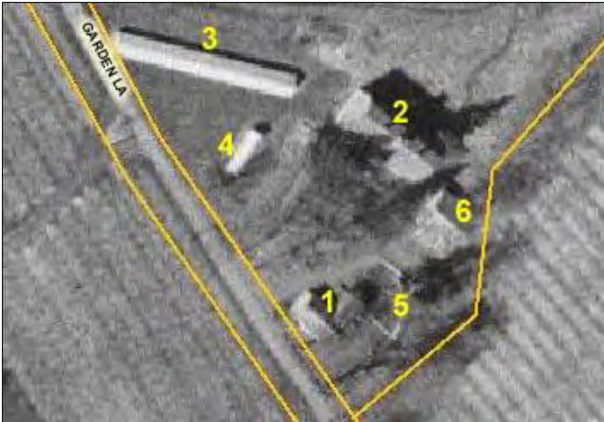
Site plan. Numbers are keyed to list of historic components listed below.