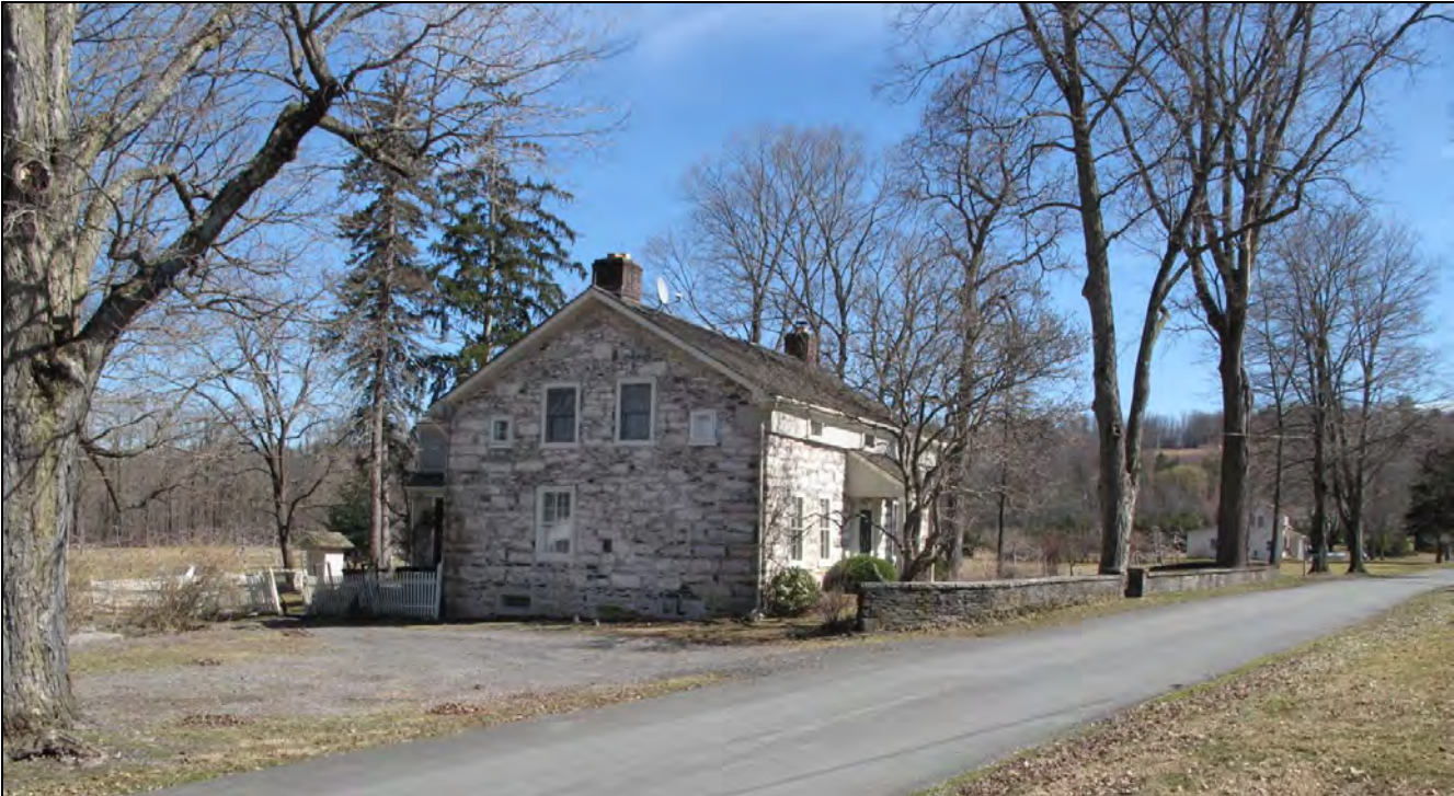
View of house from NW.