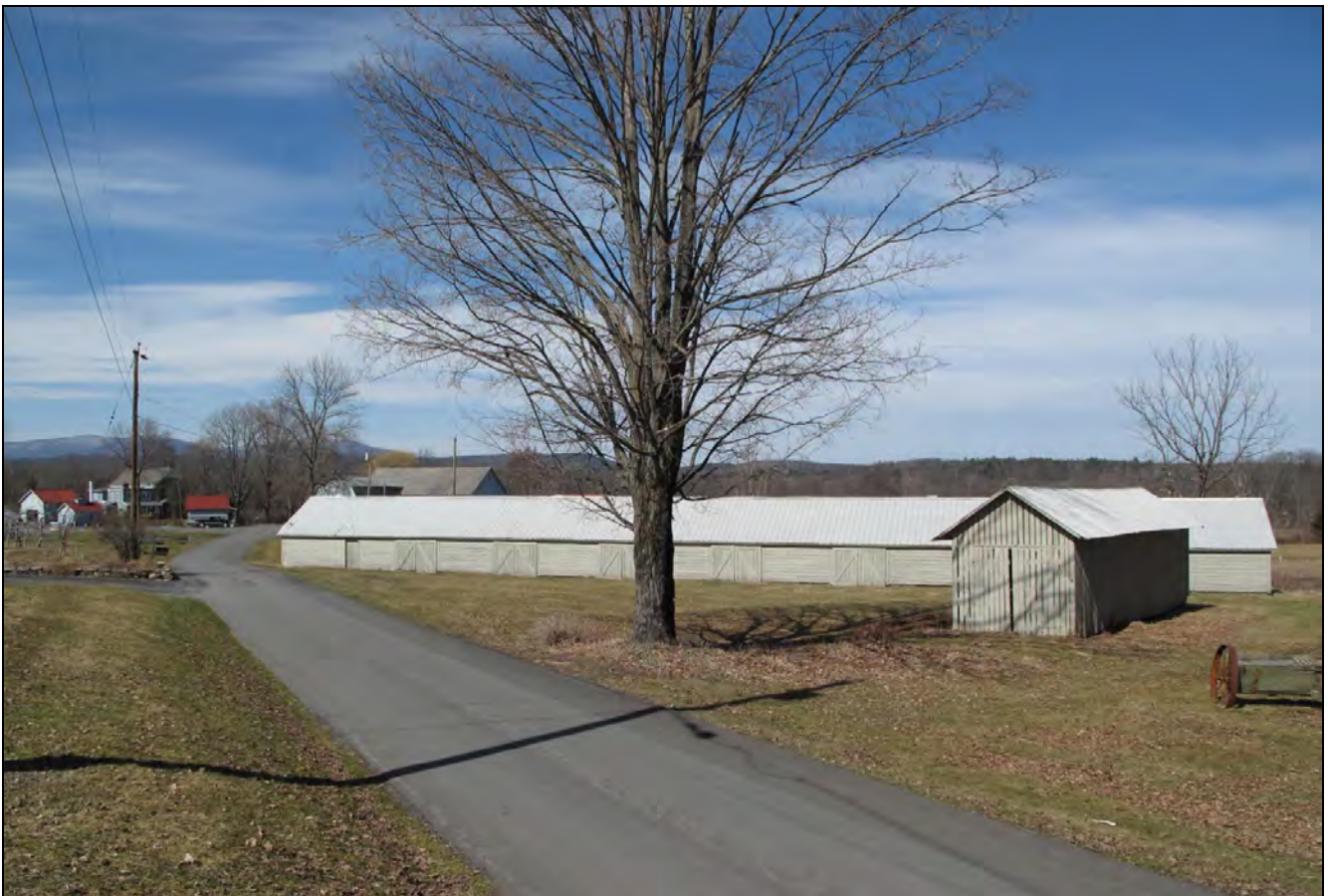
View of poultry house and corn crib from SW; Joachim Schoonmaker Farm in background.